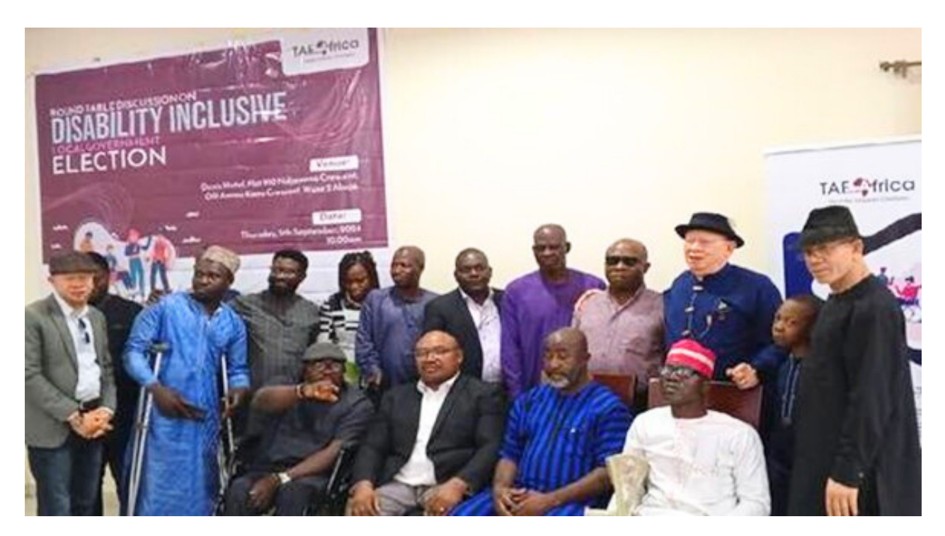
Select participants in a group photograph

PWDs were collectively encouraged to take full advantage of the provision of the law and the goodwill of President Tinubu to ensure the autonomy of local government administrations in Nigeria. In driving PWD inclusion, it was advised that women with disabilities should be prioritised as they are often faced with dual exclusions of gender and disability.