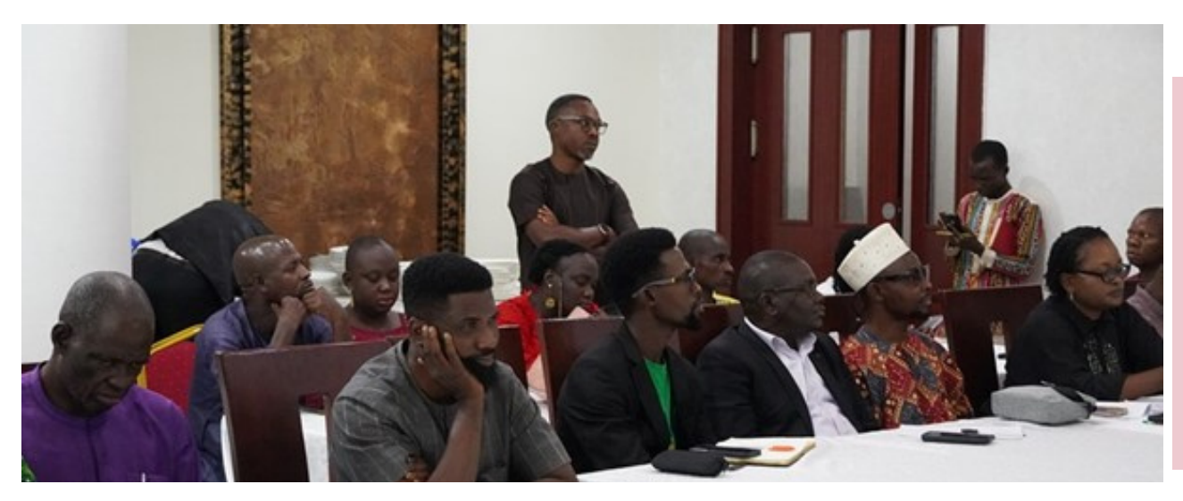
Cross-section of Participants at the Roundtable Discussion