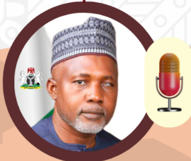
Hon. Dr. Yusuf T. Sununu Minister of State, Humanitarian Affairs & Poverty Reduction