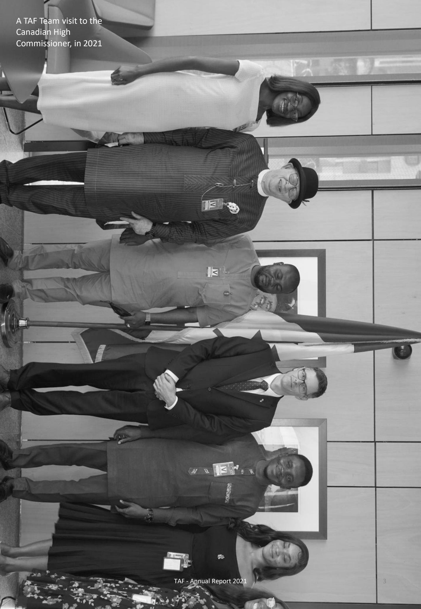
A TAF Team visit to the Canadian High Commissioner, in 2021