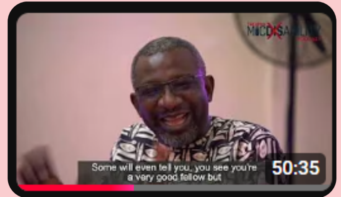
Can you marry a person with disability?

From highlighting disability rights, breaking down obstacles in education and employment inclusion, to sharing the inspirational tales of Nigerian changemakers, there is something for everyone—whether you are a student, professional, advocate, or simply curious about creating a more inclusive society.