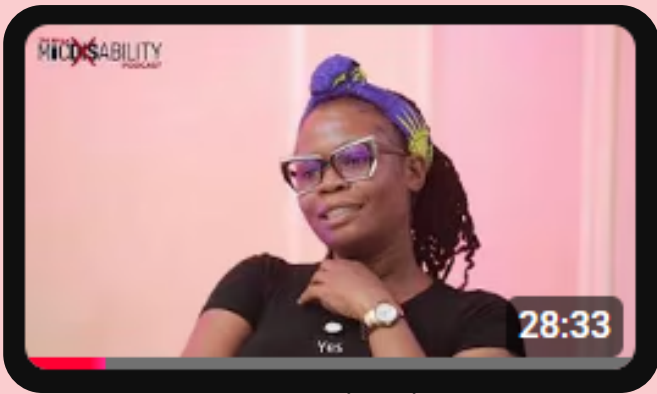
Part 1: Access to Work Scheme ...